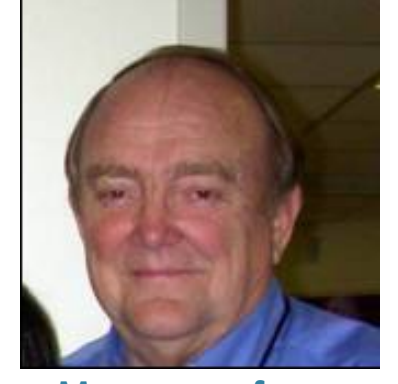
Message from the Chairman

As we put positive energy into our future plans it is necessary that we have inputs from all of you. The SDRC Board can only go forth with plans if we have the support of the complete community. We are adding some additional staff to the organization so that we have more people covering the workings of the SDRC. If you have suggestions as to what we could add or do to make us a more viable organization, please feel free to let us know.