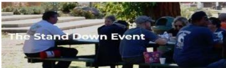
The Stand Down Event

Green Oak Ranch, 1237 Green Oak Road, Vista, CA 92081