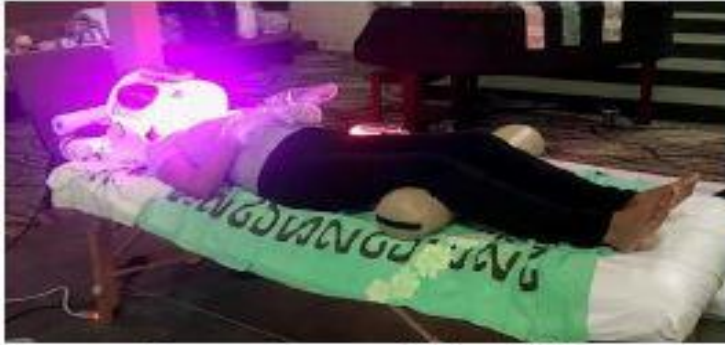
Dream Spa and Hand Wax