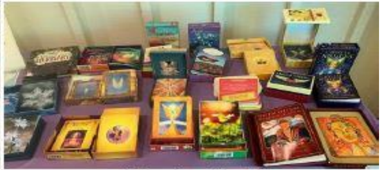
Divination for All