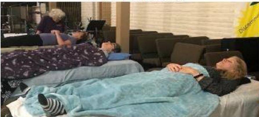
BEMER and BioMat