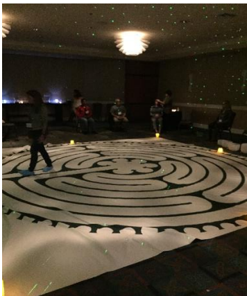
Energy Room 2016

Come join us in the Energy room at the AIHM Conference. It is truly a heart felt opportunity.